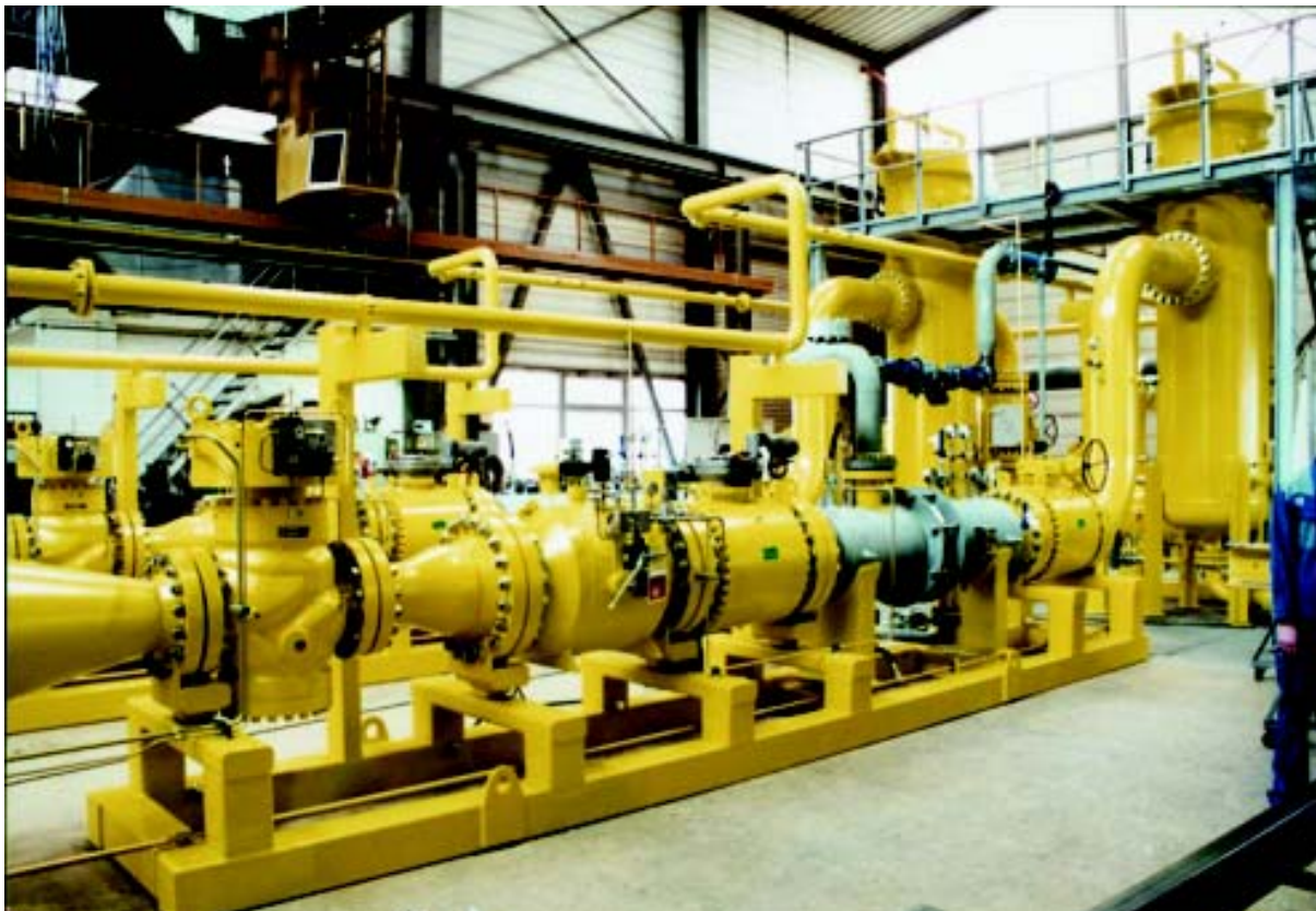
Safety Shut-off Valve Type AX in a high pressure gas reducing station for a power plant. Axial design for pressure rating of 80 bar